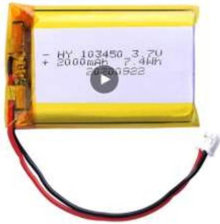
PH 2.0 plug