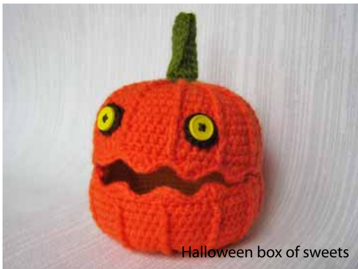
Halloween box of sweets