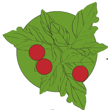
← tomato plant