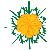
← marigold plant