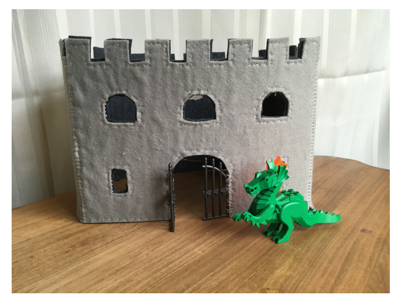
Once upon a time there was a dragon who lived in a castle.